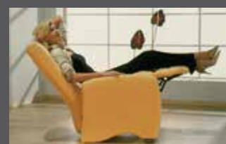
separate el. adjustment with or without external storage battery

Separate adjustment of leg rest and backrest by means of individual motors.