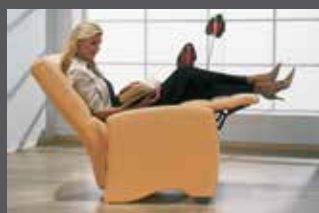
seat manual back with gas spring

Adjustment of the leg rest by body pressure. Adjustment of the backrest using an internally positioned actuating loop for safe stepless fixture.