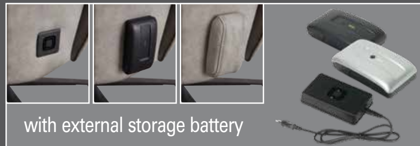
with external storage battery