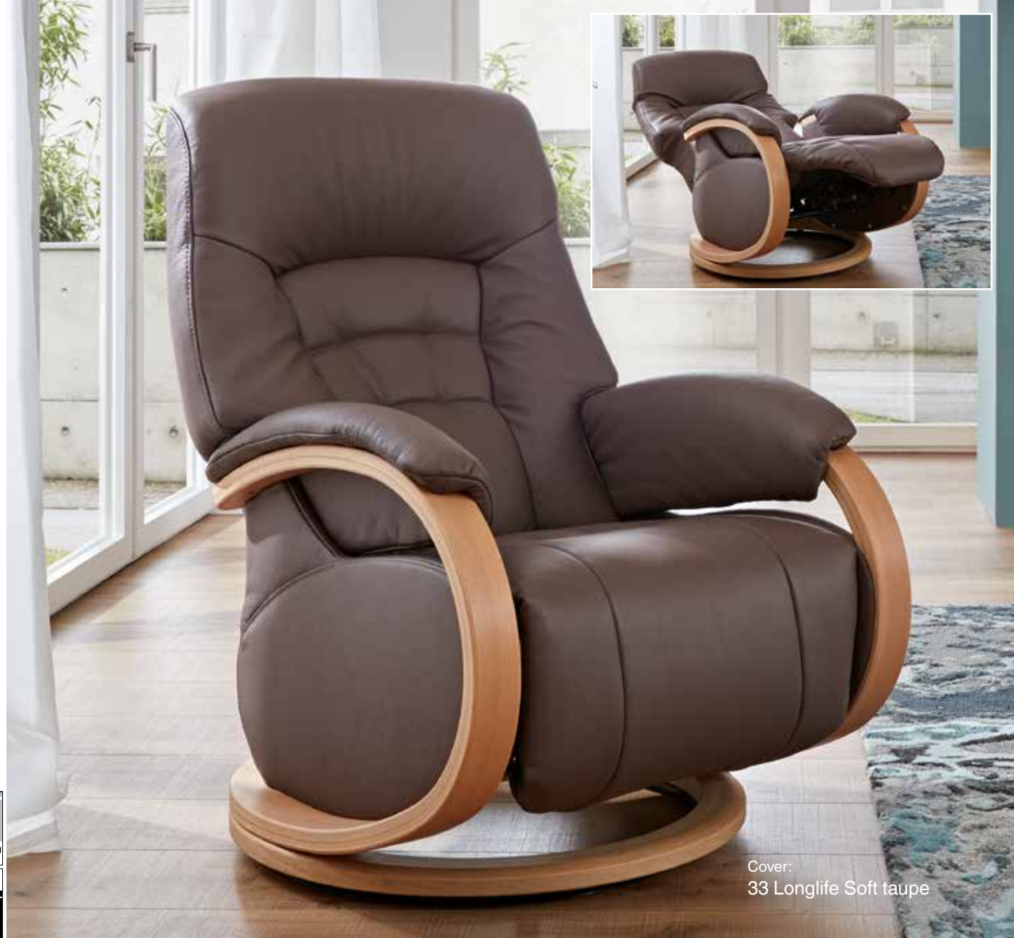
Cover: 33 Longlife Soft taupe