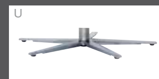
star base stainless steel look