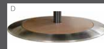
wood with stainless steel ring