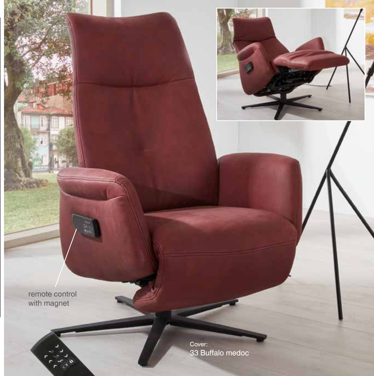
remote control with magnet