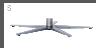
star base chromed