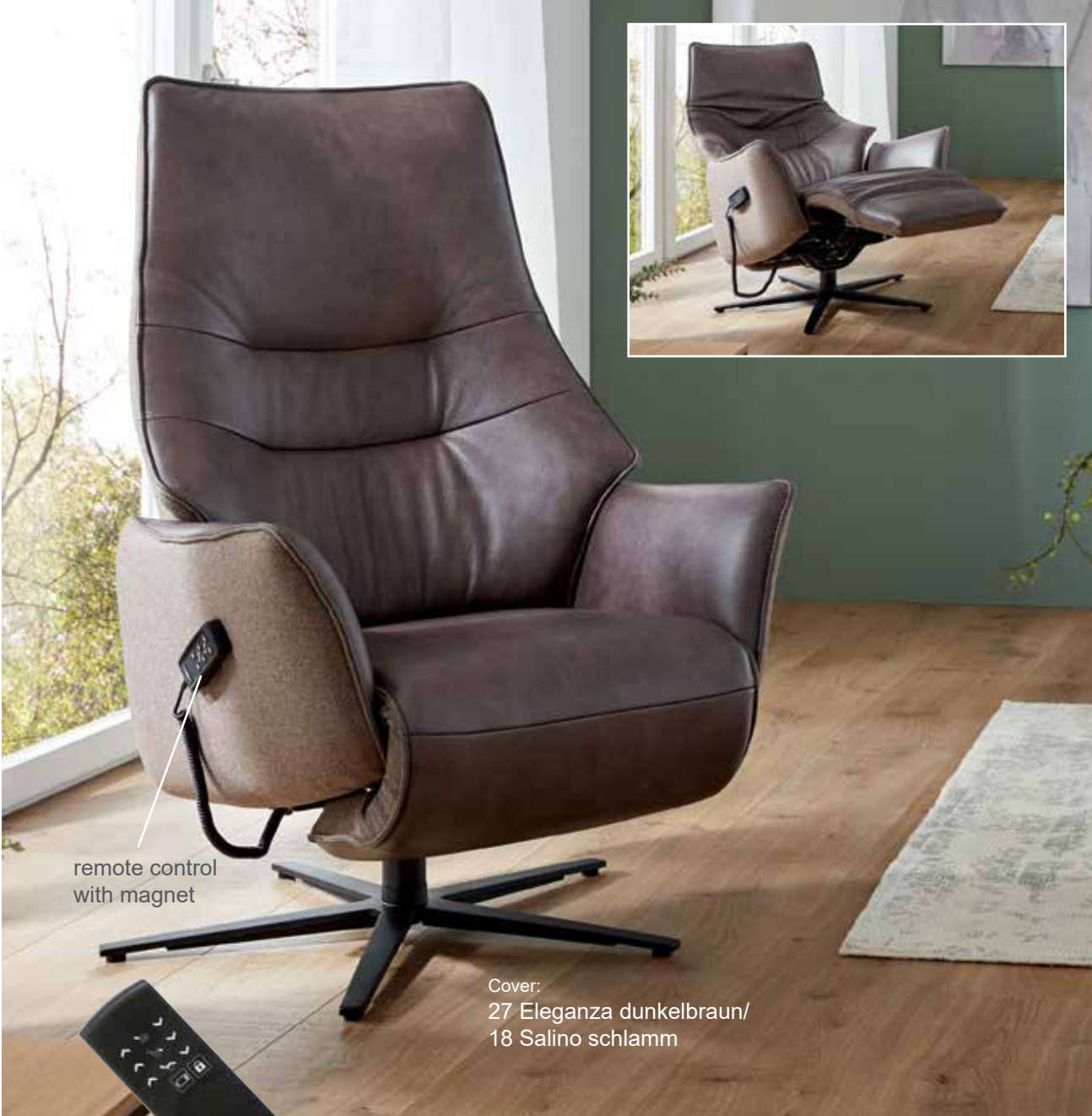
remote control with magnet