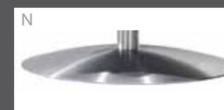
N stainless steel look