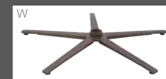
W star base powder-coated bronze