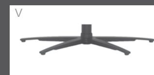
V star base powder-coated anthracite