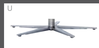
U star base stainless steel look