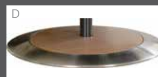
D wood with stainless steel ring