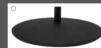
O powder-coated anthracite