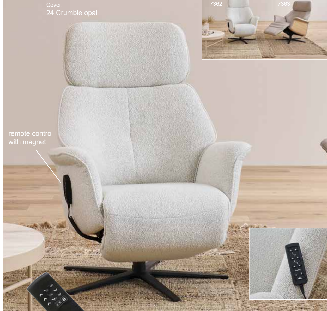
Cover: 24 Crumble opal