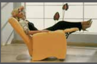
separate el. adjustment with storage battery

P – wooden feet Q – alu feet O – plastic gliders