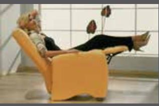
separate el. adjustment of leg rest and backrest

A – wooden feet H – alu feet X – plastic gliders