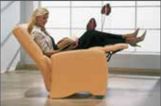
seat manual back with gas spring

B – wooden feet F – alu feet J – plastic gliders