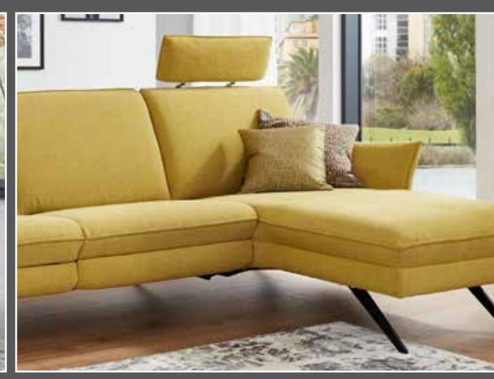
Variant 42 recamière with with fold-out headrest